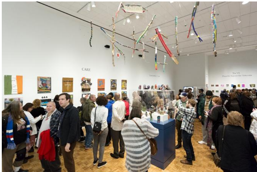
Community Group Show opening reception

CARE of Southeastern Michigan Macomb County Community Mental Health Crossroads Clubhouse Comprehensive Services for the Developmentally Disabled Tri-County Veterans Navigators