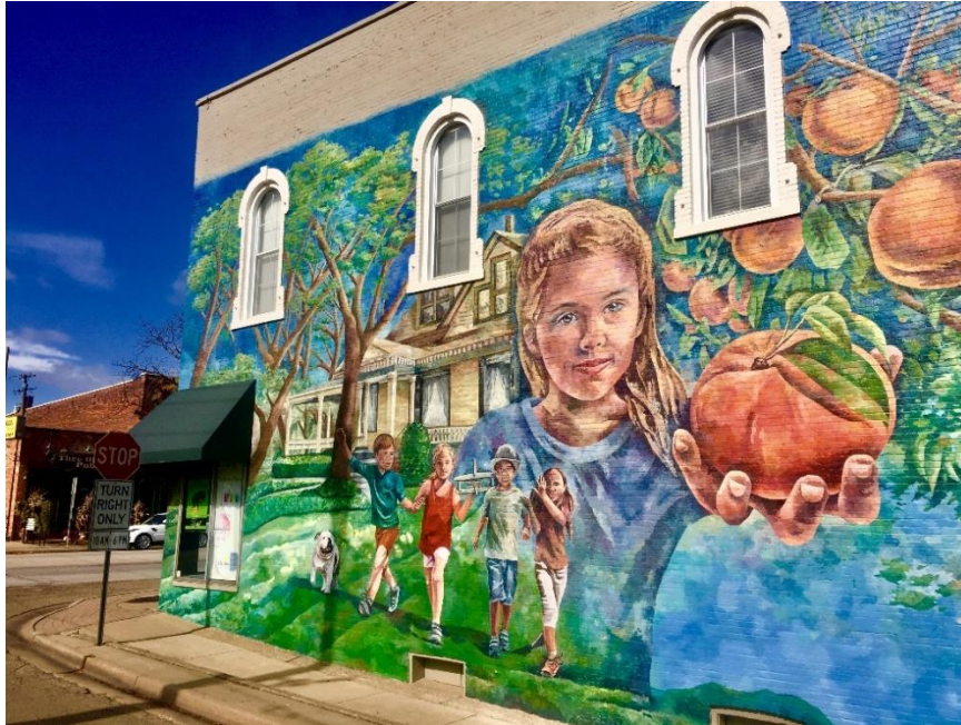
Romeo Mural Project at Starkweather Arts Center

In 2019 the DIA worked with the City of Warren to create a family-friendly mural in the Warren Community Recreation Center. The DIA also worked with Starkweather Arts Center and the Downtown Development Authority in the Village of Romeo to create a mural on a downtown building that reflects the spirit of the Romeo community.