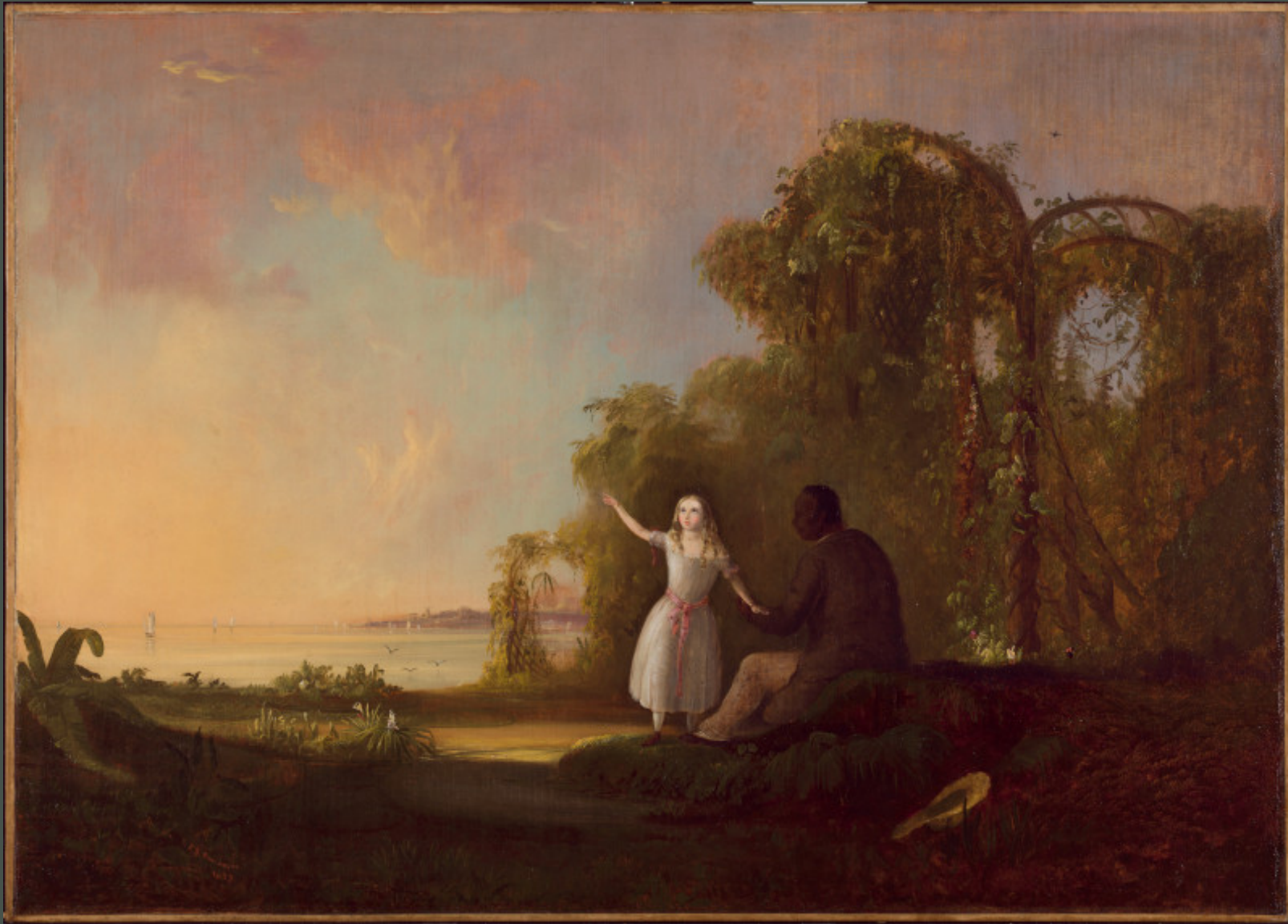
Uncle Tom and Little Ava, 1853 Robert S. Duncanson