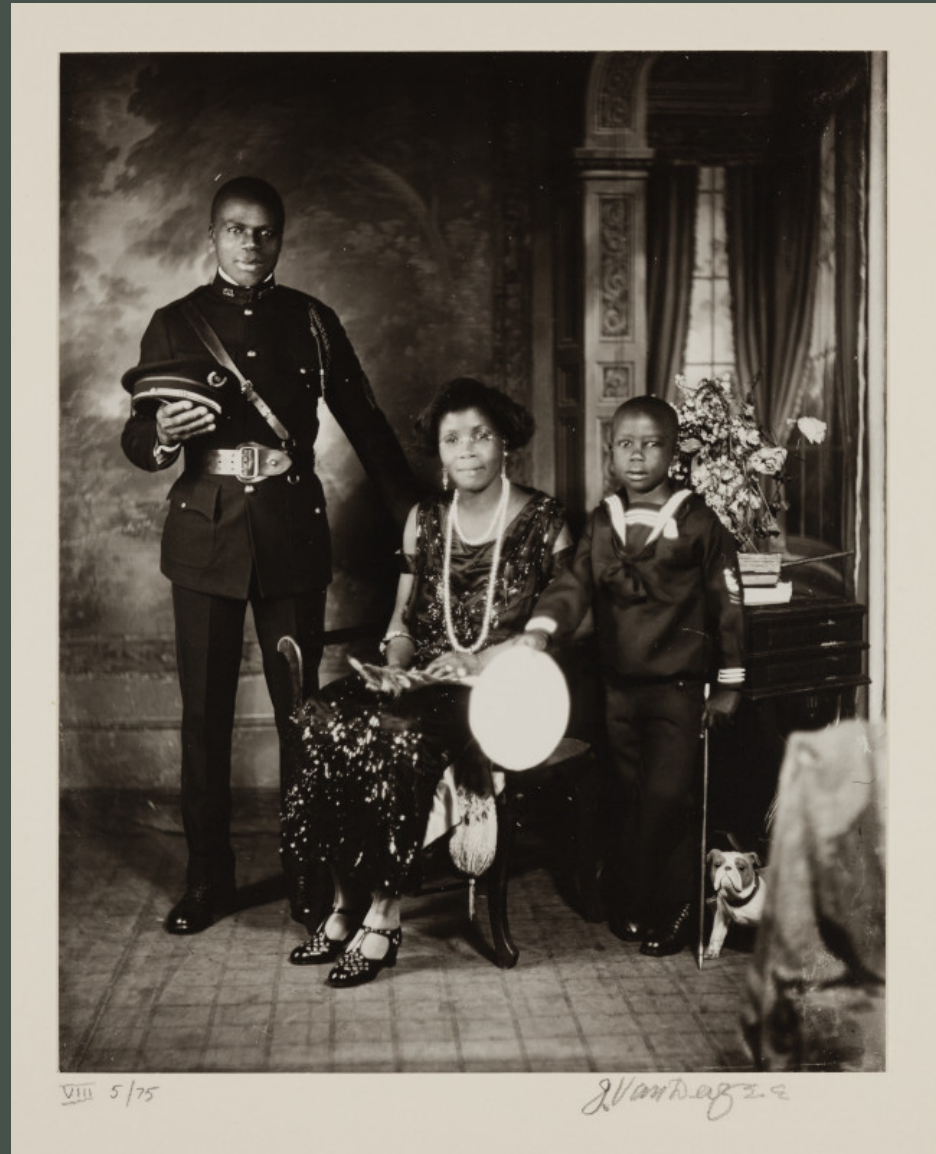
A Member of Garvey's African Legion with his Family, 1924 James Van Der Zee