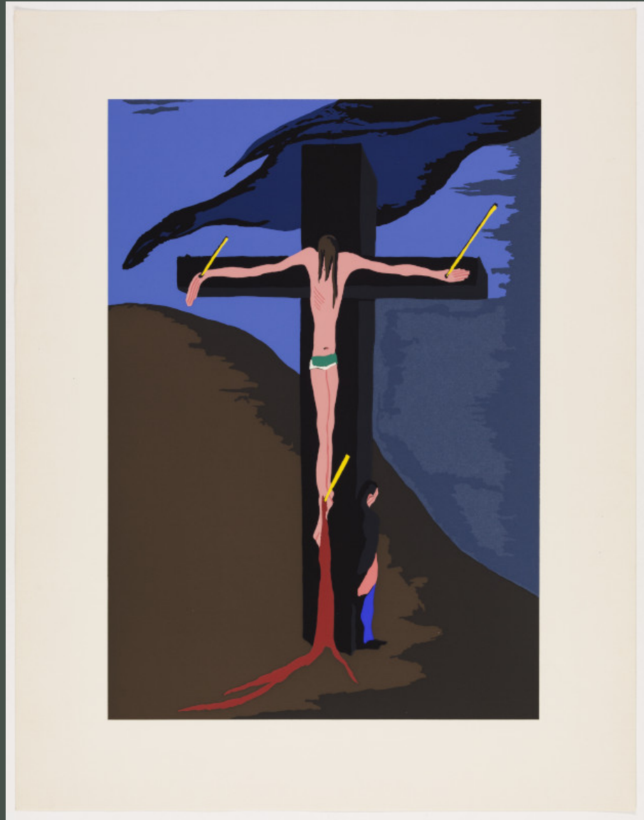
The Legend of John Brown, 1941 Jacob Lawrence