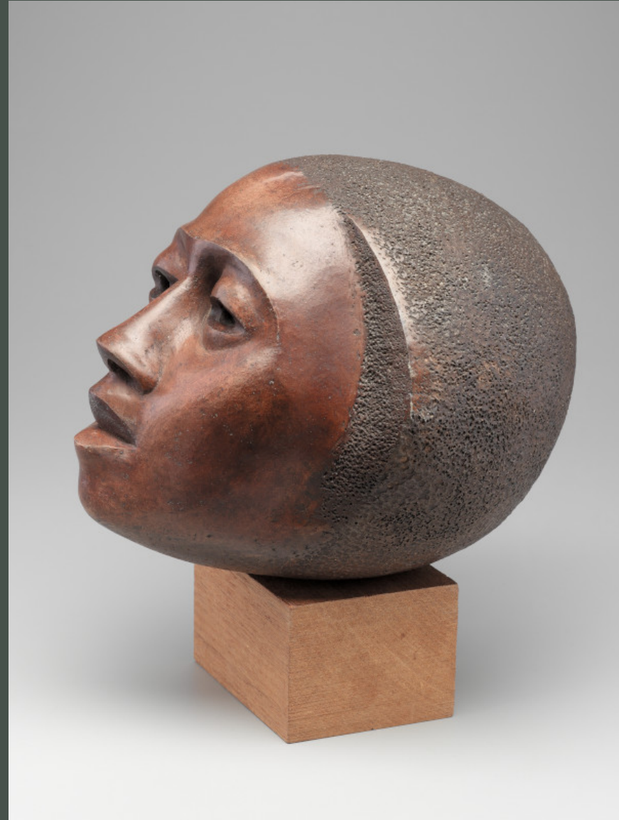
Terra-Cotta Head, 1960 Elizabeth Catlett