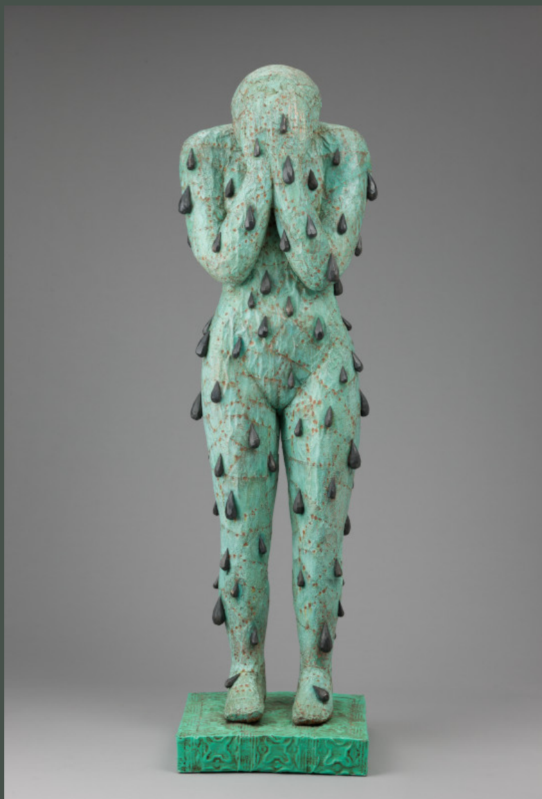
Blood/Sweat/Tears , 2005 Alison Saar