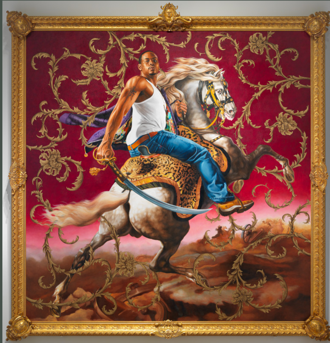
Officer of the Hussars, 2007 Kehinde Wiley