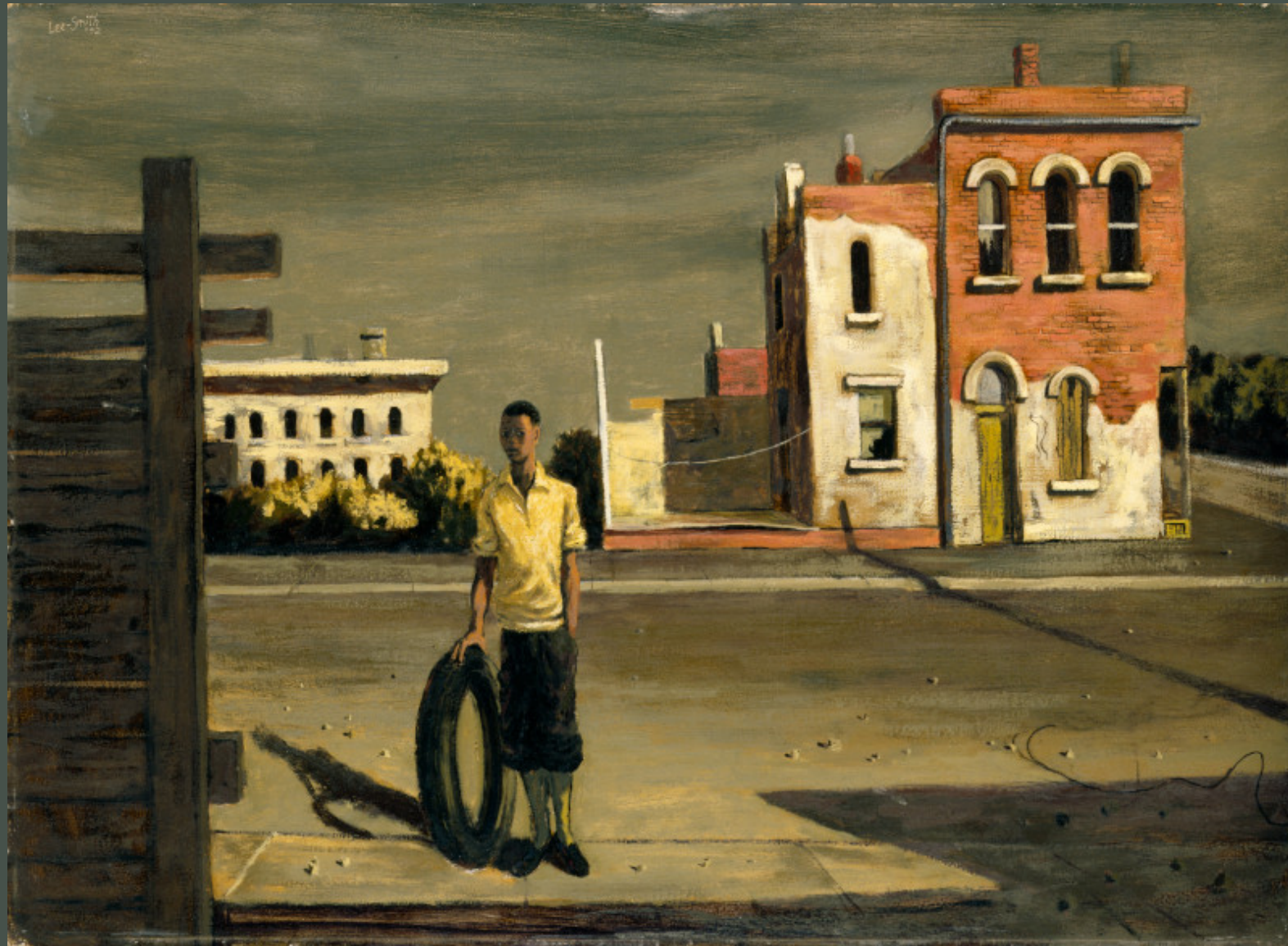
Boy with Tire , 1952 Hughie Lee-Smith