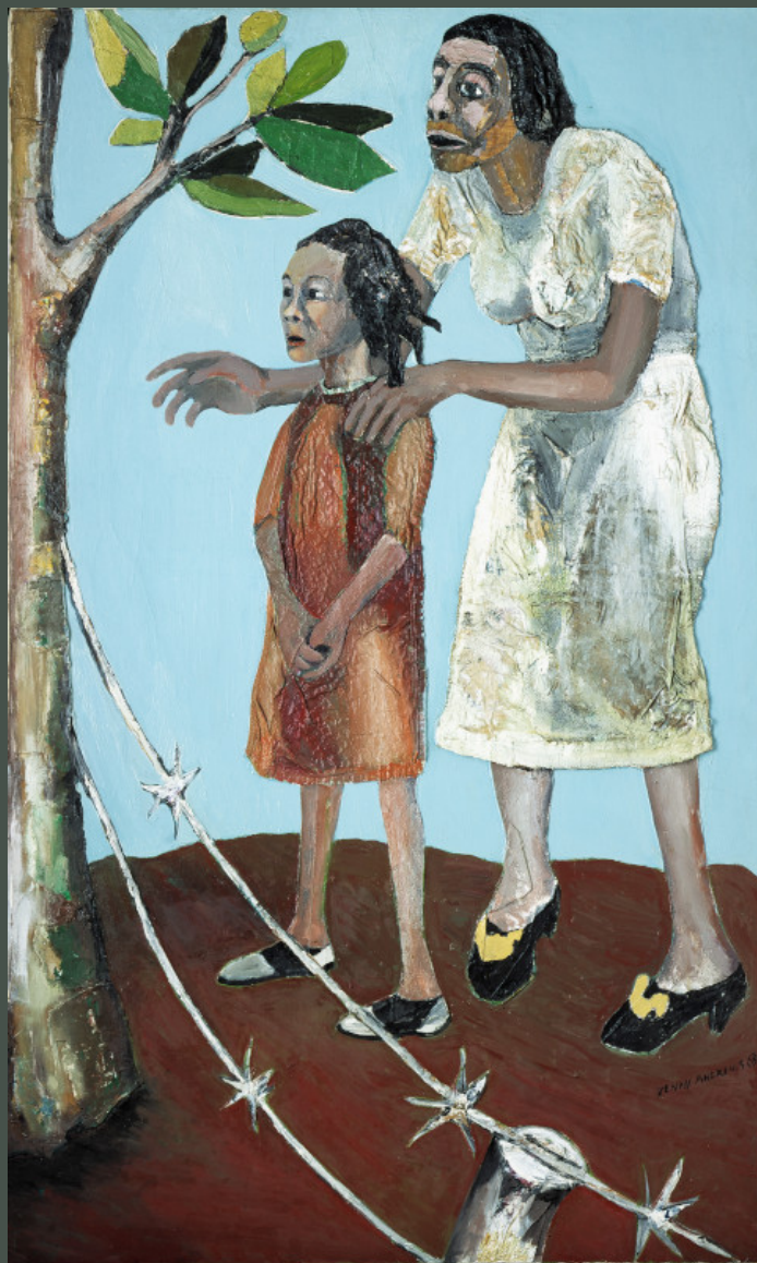
Southern Pastures , 1963 Benny Andrews