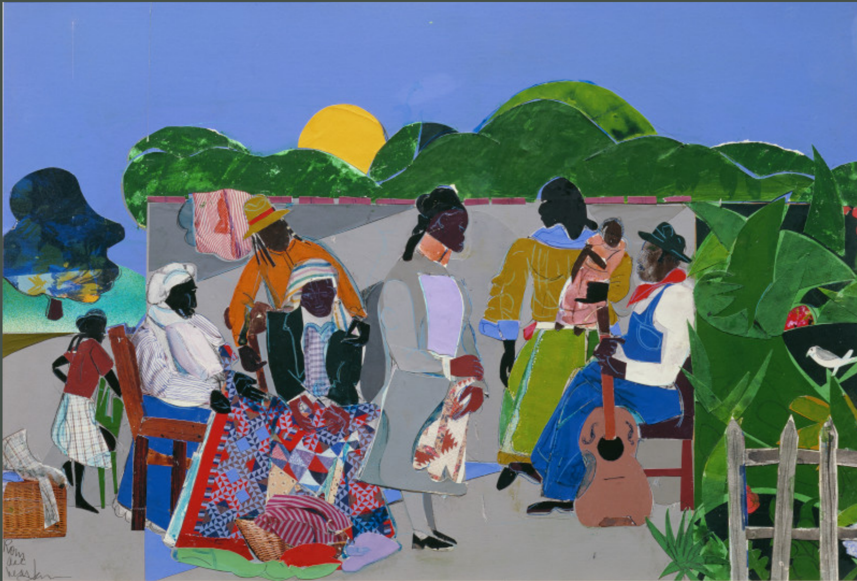
Quilting Time, 1986 Romare Bearden