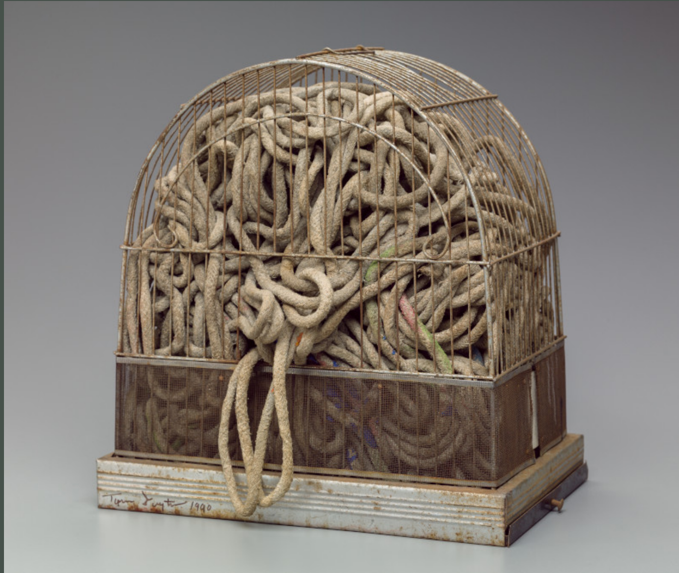
Caged Brain, 1990 Tyree Guyton