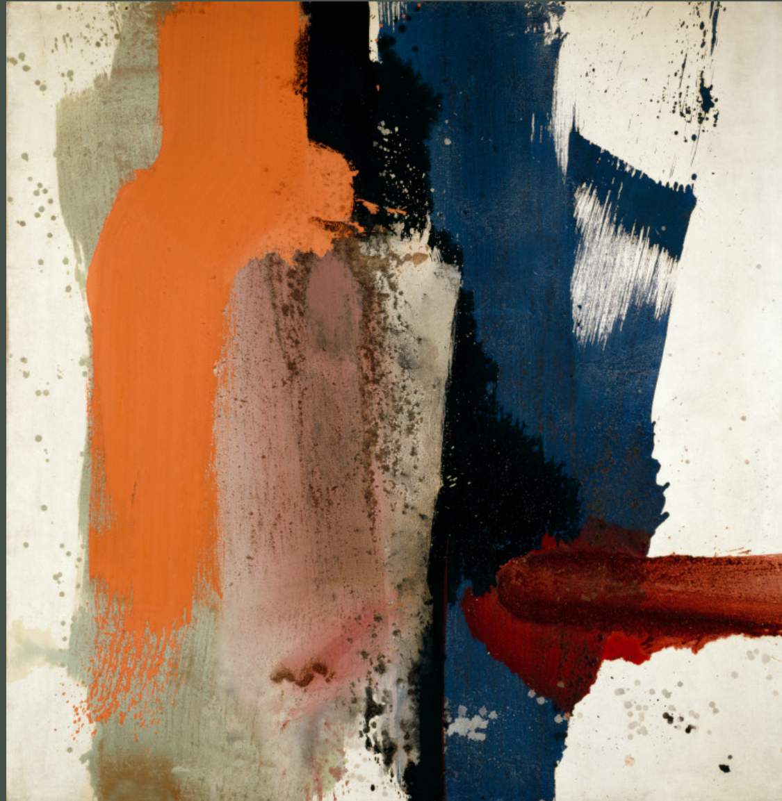
Maple Red , 1963 Edward Clark