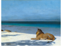
Solitude , Jean-Leon Gerome