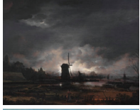
Moonlit Landscape with the Windmill Aert van der Neer