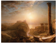
Syria by the Sea , Frederick Edwin Church