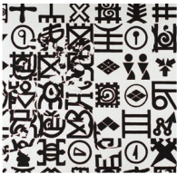
Movement #27 , Kwesi Owusu Ankomah