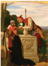
4 Market Center Park – Southgate Market Place, just beyond pavilion 13631 Eureka Rd Staunch Friends, Canaletto