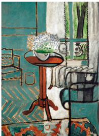
3 Market Center Park – Southgate Market Place, wall before park 13631 Eureka Rd The Window, Henri Matisse