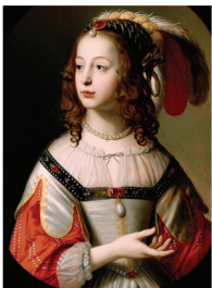
5 Market Center Park – Southgate Market Place, back entrance by theatre 13631 Eureka Rd Portrait of Sophia, Princess Palatine Gerrit van Honthorst