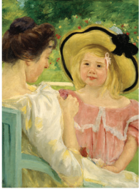
1 Southgate City Hall 14400 Dix Toledo Rd In the Garden, Mary Cassatt