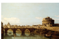
406 Mill Pond Ln. View of the Tiber in Rome with the Castel Sant' Agnolo , Bernardo Bellotto