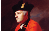
Millpond Park Veteran's Memorial 424 Mill Pond Ln. Colonel John Montresor , John Singleton Copley