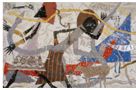
The White Dress 209 W. Main Noah's Ark: Genesis , Charles McGee