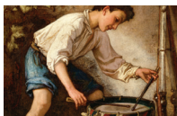
Brewery Becker 500 W. Main St. Drummer Boy , Thomas Couture