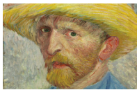
Downtown Main 201 W. Main St. Self Portrait , Vincent van Gogh