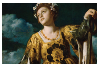
The Pavilion 421 Mill Pond Ln. Allegory of Hope , Alessandro Turchi