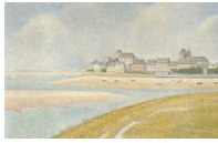
Anton Art Center 125 Macomb Pl. View of Le Crotoy, Upstream Georges Seurat