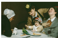
Bath City Bistro 75 Macomb Pl. The Merrymakers Carlus-Duran