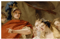
Macomb County Courthouse 40 N. Main St. The Women of Darius Invoking the Clemency of Alexander Giovanni Domenico Tiepolo