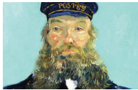
Westborn Market 860 Penniman Ave. Portrait of Postman Roulin , Vincent van Gogh