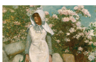
Plymouth District Library 223 S. Main St. Girl and Laurel , Winslow Homer