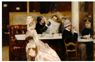
The Sardine Room 340 S. Main St. Café Scene in Paris , Henri Gervex