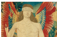
Northside True Value Hardware 2912 S. Wayne Rd. Eros Triumphant, Unknown Artist, French