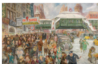
Wayne Historical Museum 1 Towne Square St. Fourteenth Street at Sixth Avenue, John Sloan