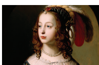
Portrait of Sophia, Princess Palatine, Gerrit van Honthorst