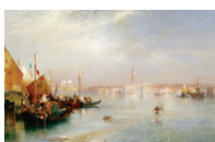
City Hall 3355 S. Wayne Rd. The Fisherman's Wedding Party, Thomas Moran