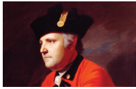
35613 W. Michigan Ave. Colonel John Montresor, John Singleton Copley