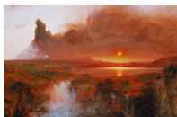
State Theater 35310 Michigan Ave. Cotopaxi, Frederic Edwin Church