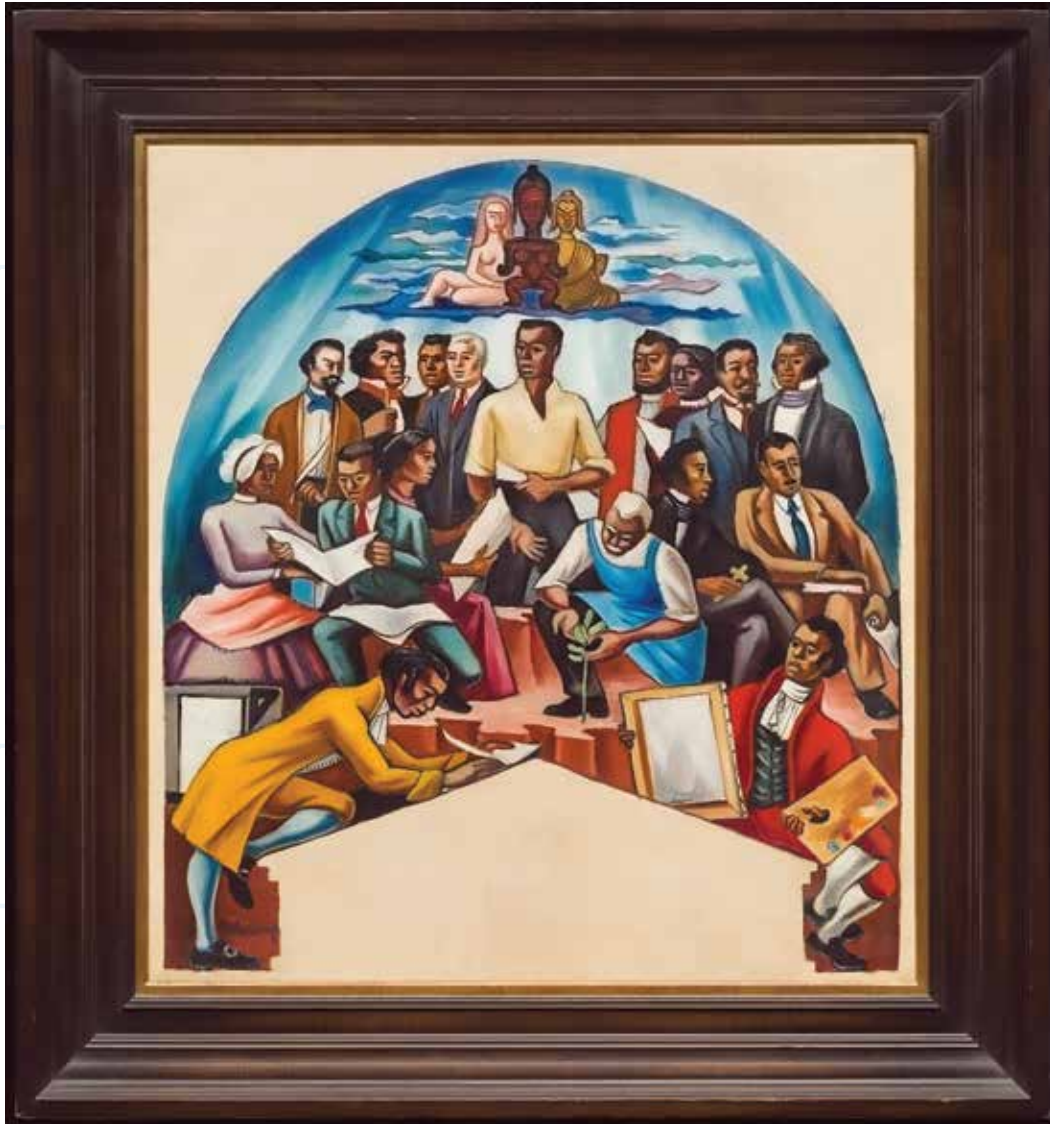
The Art of the Negro: Artists (Study) by Hale Woodruff, 1950–51. Detroit Institute of Arts.

The DIA's Weekly Crossword features clues that are answered by picking out details from a work of art from our collection. To solve this week's puzzle, you'll have to look closely at Hale Woodruff's The Art of the Negro: Artists (Study) .