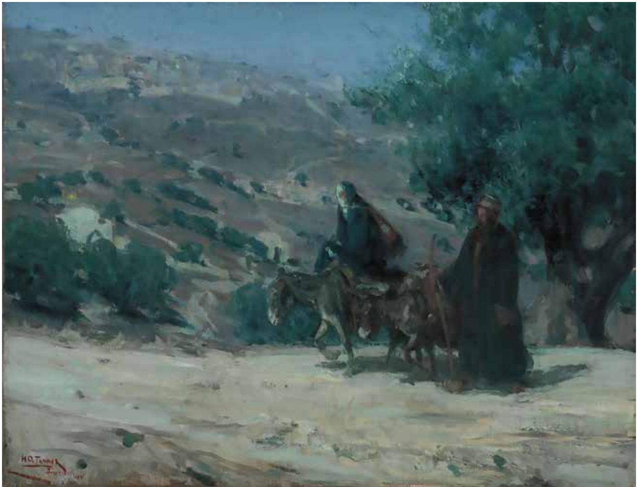
Flight into Egypt by Henry Ossawa Tanner, 1899. Detroit Institute of Arts.

The DIA's Weekly Crossword features clues that are answered by picking out details from a work of art from our collection. To solve this week's puzzle, you'll have to look closely at Henry Ossawa Tanner's Flight into Egypt .