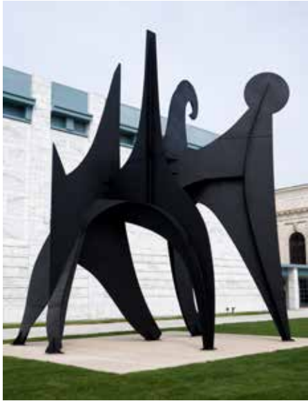
Young Woman and Her Suitors 1970, Alexander Calder, American; Painted steel

American artist Alexander Calder first trained as an engineer before studying art. He's known for his playful, airy works made of simple shapes cut from sheet metal. Some of them include moving parts and he called those "mobiles."