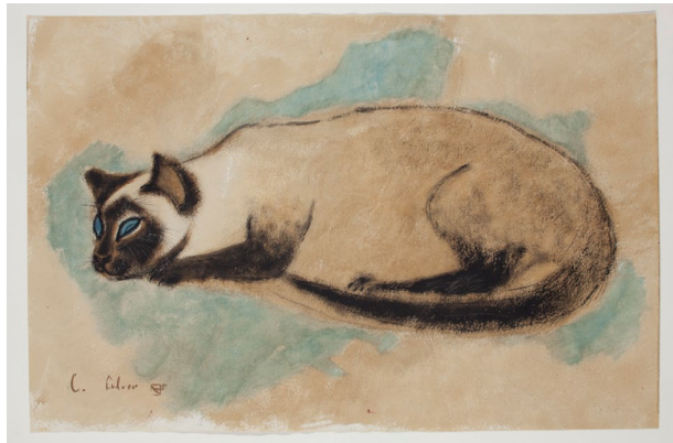
Cat , Charles Culver, mid 20th century, American; watercolor over black chalk and graphite pencil on off-white wove paper

Charles Culver created drawings with very simple lines that reflect the contours of his many subjects and his close and careful observations of the natural world. Drawing in its purest form is the making of lines and marks to express or represent something. If you think you can only draw “stick figures,” here’s an opportunity to expand on that ability.